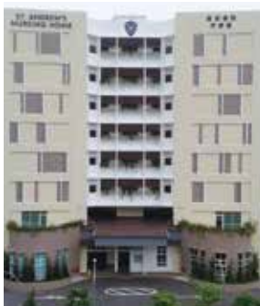
St. Andrew's Nursing Home (Queenstown)

Residents' daily activities at SANH include rehabilitative exercises, cognitive cum social skills training and recreational activities.