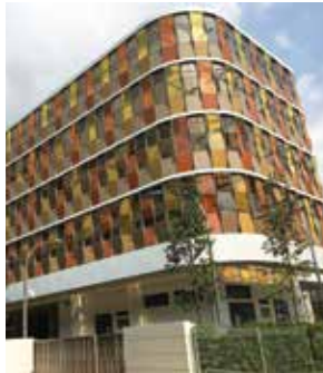
St. Andrew's Nursing Home (Henderson)

Many of the residents from St. Andrew's Nursing Home require long term care and close nursing supervision. With an integrated residential service that provides ongoing care as well as help with daily activities, it is our intent to provide the residents with compassion, love and assurance to bring comfort, healing and hope.